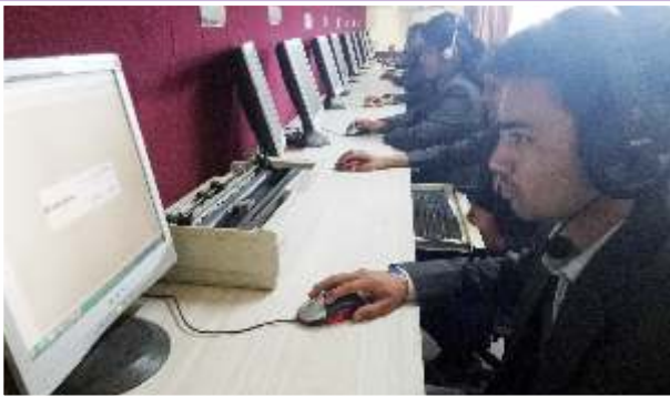
Visual Classroom lets you collaborate in real time during online delivery of classes and training sessions