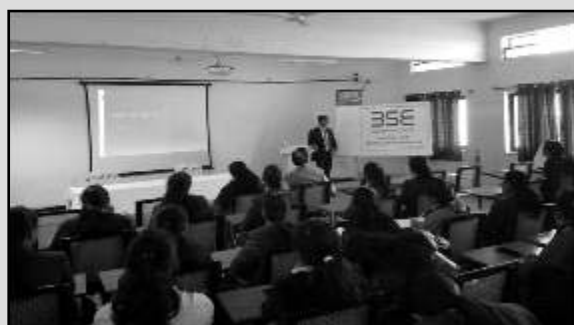
BSE: Mutual Fund and financial planning 09/01/2018