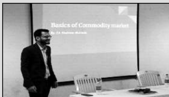
Commodity Market 03/02/2018