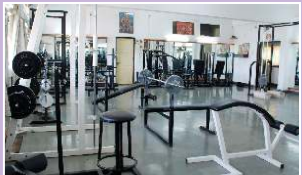
A gymnasium of 639 Sq.m. area is provided with necessary advanced equipment like Multi-Gym, Sauna and Steam bath