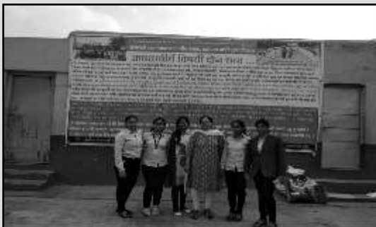
Donation Drive at Adhartirth Ashram, Trimbak

Management Studies Students' Association: An Association of Students is formed by the department. Students arrange various lectures, competitions and activities through this association.