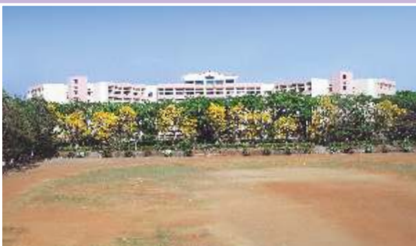
Playground with running track, Cricket pitch, Tennis court, Basketball and Volleyball court