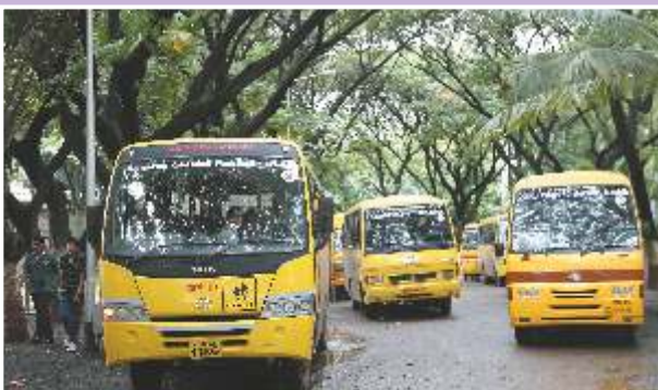
Provides transport facility to the students from various parts of Nashik