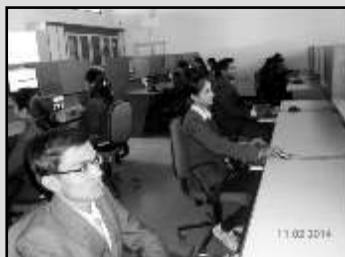
Lab II Area: 87.05 Sq. m Equipment cost: Rs. 14,82,535/-