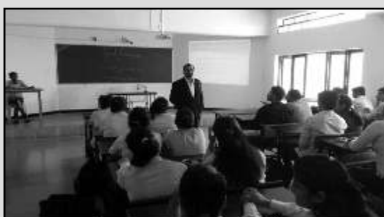
Social Security Law 16/09/2017