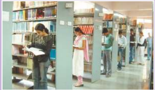
A well-established library with huge collection of Books