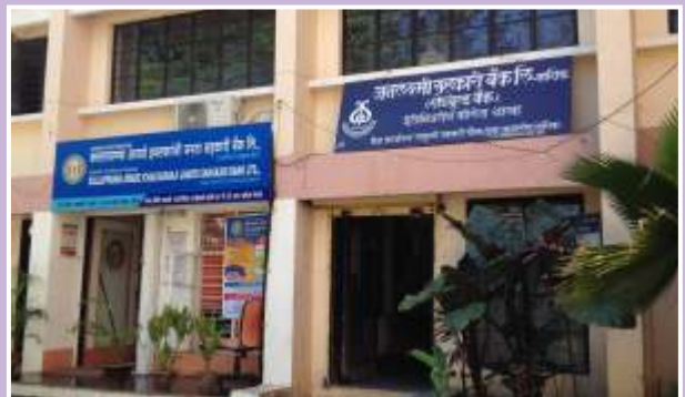
The campus also provides banking facilities to the students and staff through a fully fledged branches of Banks