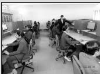
Lab I Area: 87.05 Sq. m Equipment cost: Rs. 12,33,747/-