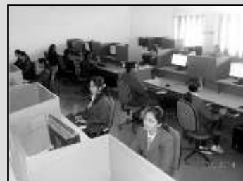
Lab III Area: 105.0 Sq. m Equipment cost: Rs. 16,25,083/-