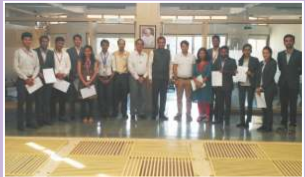
The department is committed to training & placement activities to facilitate the students of the institution to get competitive placements