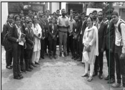
Industrial Visit to Gogate, Gabriel and Indian Tool

MBA Department has arranged Industrial Visits to companies like Mahindra and Mahindra, EPCOS Ltd., Trinity Ventures, Power deal, Lear Corporation, etc.