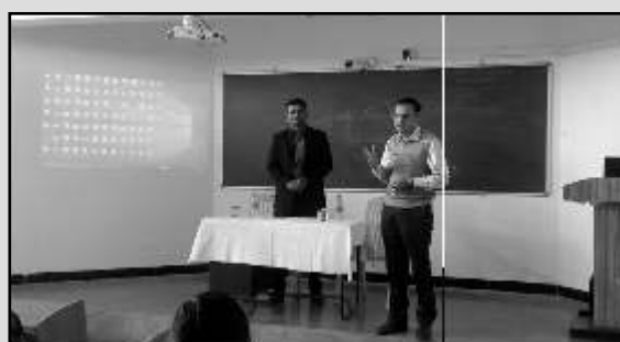
Corporate Social Responsibility 06/01/2018