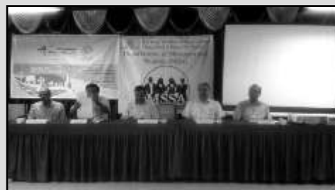
International film screening on "Environmental Awareness" in association with Kirloskar Group of Companies in August 2017