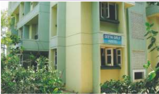
The hostel is inside the college campus with good facilities of food and good environment for the students to study