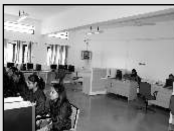
Lab IV Area: 70.00 Sq. m Equipment cost: Rs. 5,06,905/-