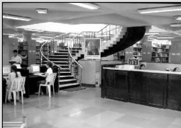
State of the art library with thousands of books