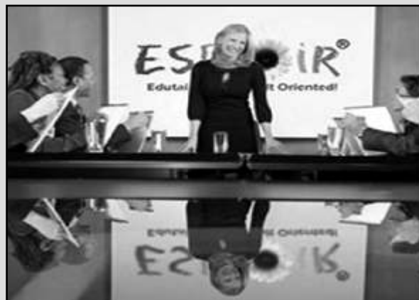
Espoir Software for placement preparation