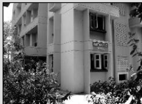
Hostel Facilities for Boys and girls with intake capacity of 225 for girls and 368 for boys