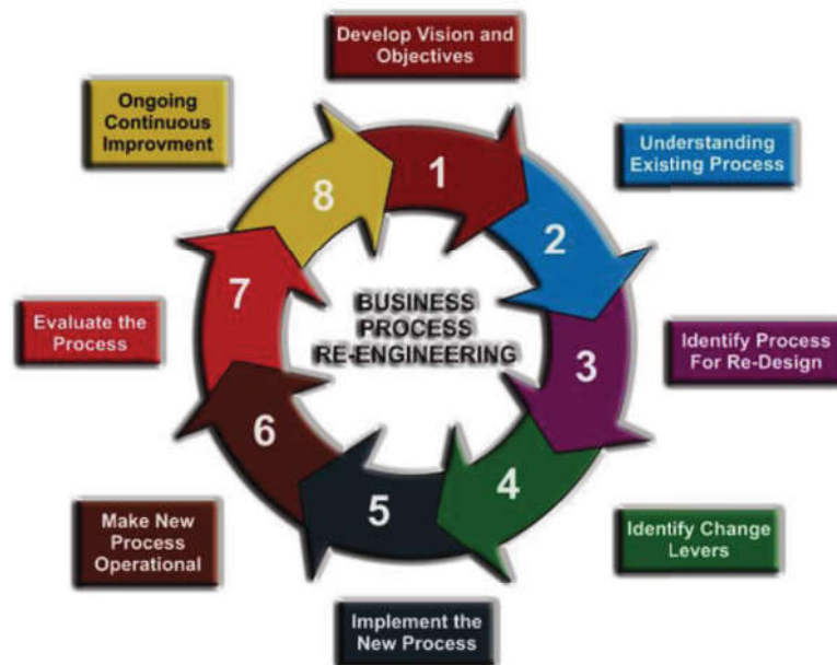
Figure 2: Structural of Business process reengineering

The PROMET BPR procedure model comprises the three phases “preliminary study”, “macro-design” and “micro-design”. The approach can be flexibly adapted to users’ needs. Thus, certain phases and activities of the procedure model may be omitted without experiencing adverse effects on project goal achievement.