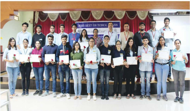
Felicitation of the previous year's Senior Student Council.