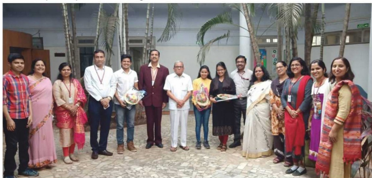
Felicitation of Campus Interview Selected Students and their Proud parents at Rasbihari International School, Nashik