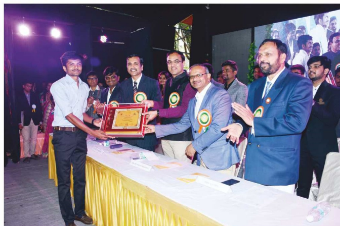
Prize distribution of MAFFICK 2020