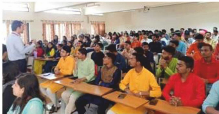
FE Induction Program