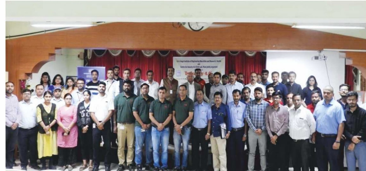
Group Photo of Participants of workshop on Industry 4.0