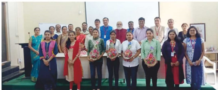
Felicitation of K K Wagh IEER Campus Interview Selected Students and their proud parents at Government Polytechnic, Nashik.

In K. K. Wagh team visited various schools and colleges in and around Nashik with an objective of felicitating the K. K. Wagh IEER students who got selected through campus interview. Our team visited their schools like Adarsh Madhyamik Vidhyalaya, Rasbihari International School, K K Wagh Polytechnic, Pravara Central School, Kothari Kanya Vidyalay etc. On this occasion school students were informed about the K. K. Wagh Education Society and its activities. Our team also appreciated the efforts of schools in building the students' strong academic and culture foundation during students' school days.