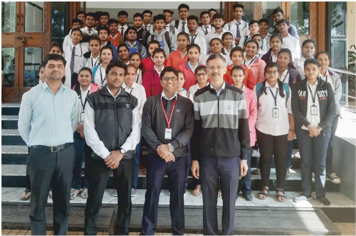
Visit by Students