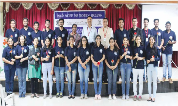
Installation Ceremony of ISTE Students Chapter 2019-2020