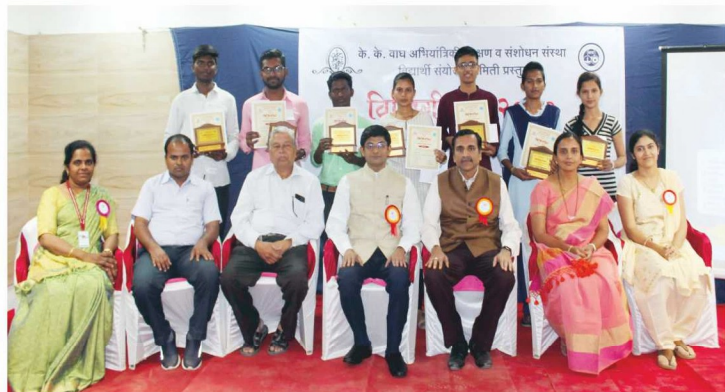
Winners of Vijigisha 2020