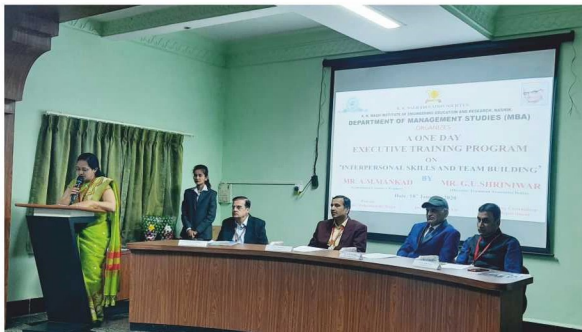
An Executive Training Program organized by MBA department