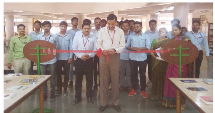
Inauguration of Exhibition of Marathi writers' literature

International Mother Language Day was observed by ISTE Students' Chapter of K. K. Wagh Institute of Engineering Education and Research, Nashik on 22 nd February, 2020.