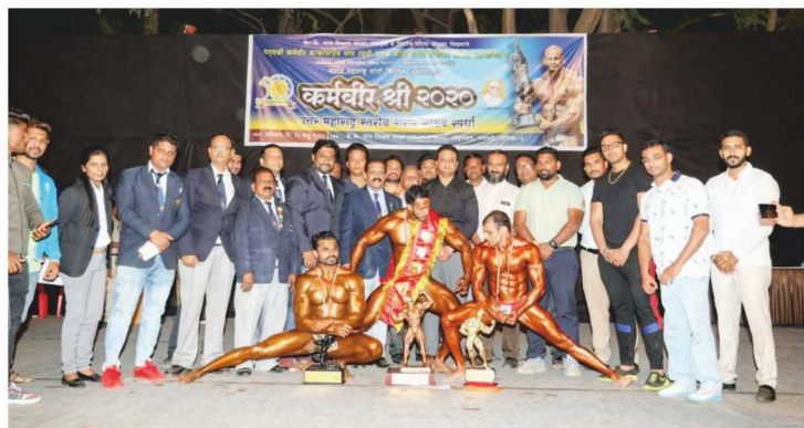
"Karmaveer Shree-2020" Body Building Competition