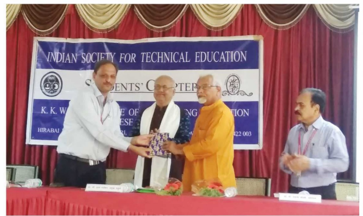
Celebration of Marathi Bhasha Gaurav Din