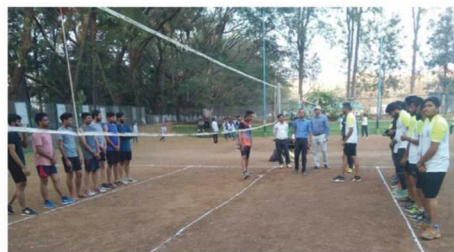
Karmaveer Sports Fest 2020 Volleyball Tournament