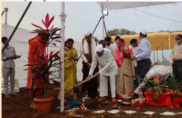
Bhumi Pujan Program of New School Complex at Puria Park

Bhumi Pujan Program of New School Complex was organized at Puria Park at 6.30am on 19 th November 2020. Bhumi Pujan was done by the hands of Hon Shri. Balasaheb Thorat (Revenue Minister, Government of Maharashtra and President of Maharashtra Congress Committee). Satyanarayan Puja was organized in early morning. At 10.00am in Meeting Hall No. 2, the program was organized for the all staff of the various institutes of K. K. Wagh Education Society. In this program Hon. Shri. Balasaheb Thorat was felicitated at the hands of Hon. President of K. K. Wagh Education Society Shri. Balasaheb Wagh. Hon. Shri. Balasaheb