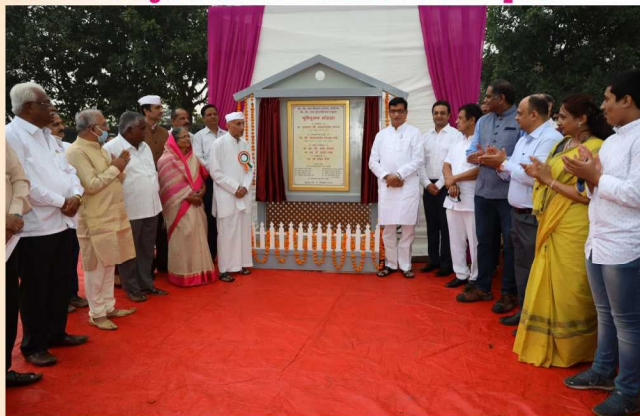
Bhumi Pujan Program of New School Complex at Puria Park