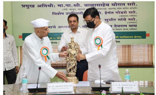
Felicitatation of Hon. Shri. Balasaheb Thorat