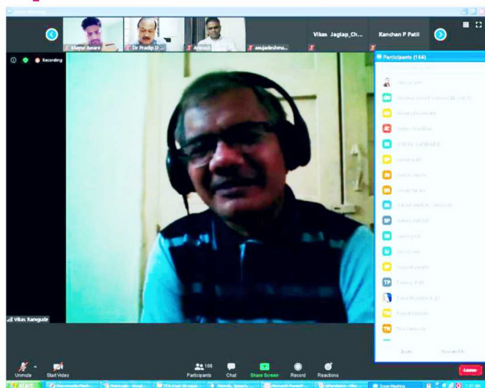
Online Panel discussion by Civil Engg Dept.