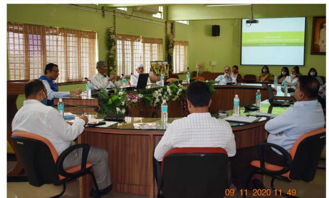
Interaction with Hon Vivek Sawant

An interaction with Hon. Vivek Sawant was arranged on 9 th November 2020. He was