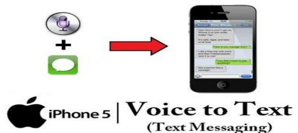
Figure 1: Speech to text (STT)

The engine exchanges the user's voice for text. The voice can be an audio file or a user's voice stream.