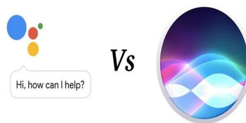
Figure 5: Competitions