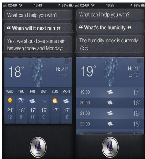
Figure 3: Tagging