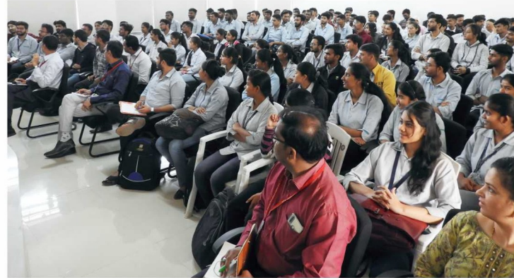
Audience for CII-CEO Connect

attended the program. The session was interactive and students asked questions related to career opportunities in engineering.