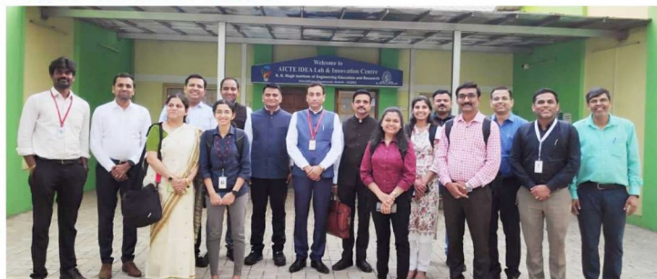
Visit of ABB Team to AICTE Idea Lab of our institute