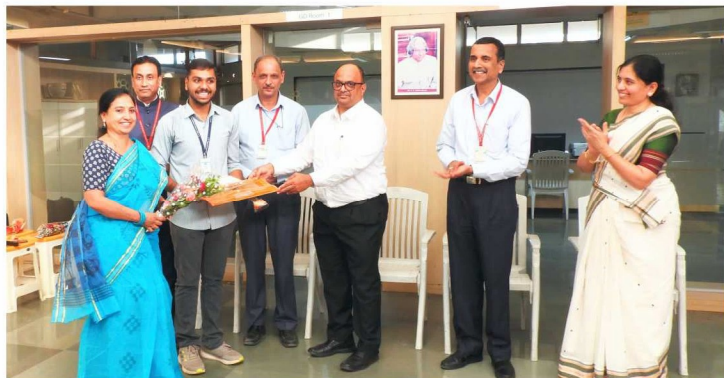
Felicitations of Students & their Parents