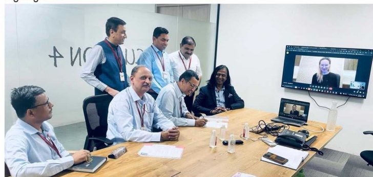
Interaction with University of Poland