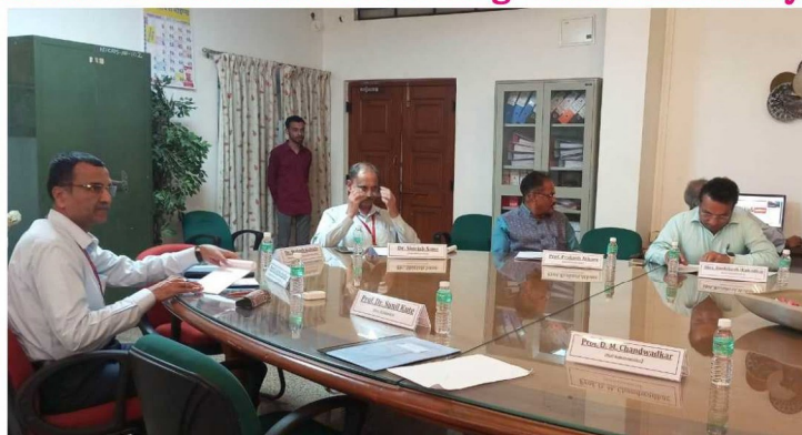
Board of Examination meeting under Autonomy