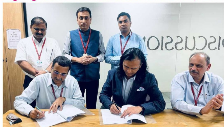
Signing of MoU