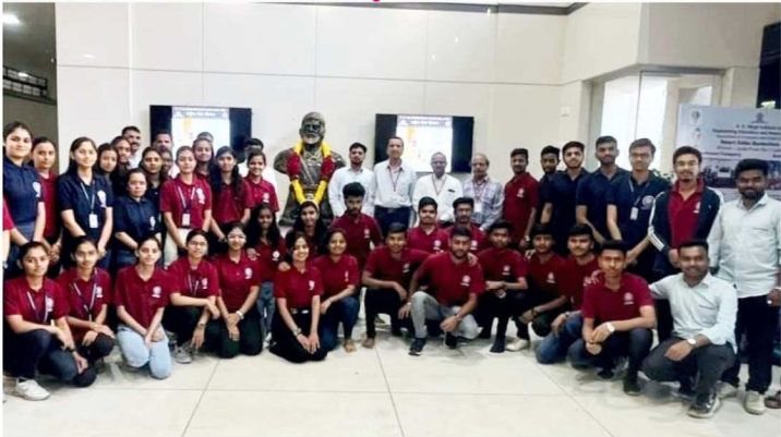
Celebration of Shiv Jayanti

Chatrapati Shivaji Maharaj was a great leader of Maharashtra and is inspiration for the youth. Students of our hostel celebrated Shiv Jayanti on 20 th Feb. 2024 in the institute porch. Members offered garland to the statue of Chhatrapati Shivaji Maharaj and remembered his contribution in establishing Hindavi Swarajya.