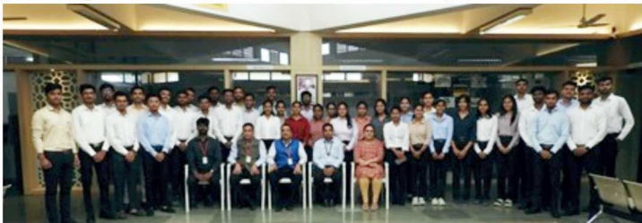
Felicitations of Electrical Engineering Students

placed students for their achievements. This year around 25 companies visited for campus interview of Electrical students. Maximum package offered was Rs. 8.5 Lacs by ABB.