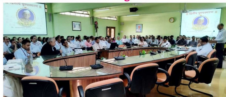
Interaction of all teaching Faculty