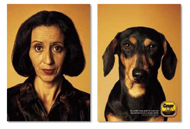
Fig:-1 Semantic gap: Visual features are similar but semantic meaning is different.

CBIR: Low level feature based search and region based search. Most of the low level feature based search techniques retrieves images based on the color layout or histogram from the pixel level. But there performance is limited because of the semantic gap between those features to the human perception system. Fig.1 shows the semantic gap [2].